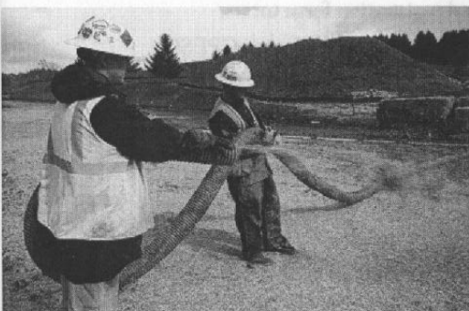
Blowing Straw Mulch.

Each participant will receive a certificate showing 6.0 Professional Development Hours (PDHs) received (pending approval).